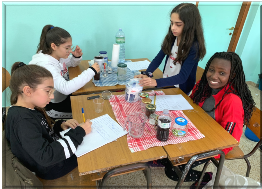
Laboratory in the classroom. Chemistry: solutions. Collaborative task: We need all hands on deck