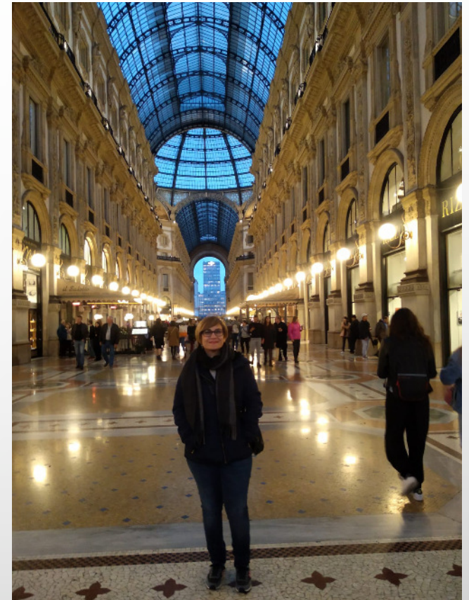
Galleria Vittorio Emanuele II