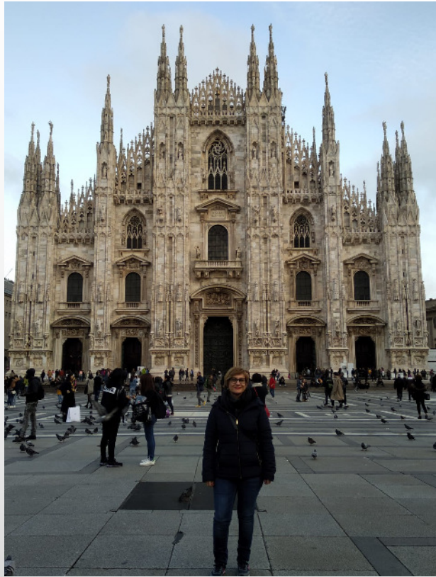
Duomo di Milano